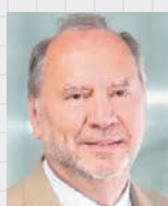
Peter Karel Piot (Speaker)

Japan Association for Cellular Agriculture, Japan Considerations in Promoting Food Products (such as Cultivated Meat) through Foodtech